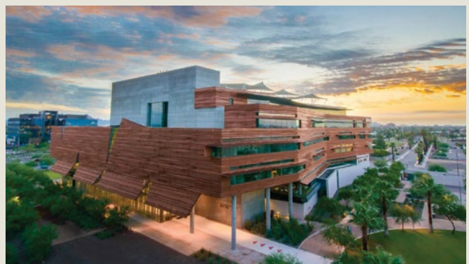
Health Sciences Education Building, Phoenix

The UA Health Sciences secured continued growth of the Phoenix Biomedical Campus. The Phoenix City Council gave approval to a five-acre expansion of the campus with the UA holding an exclusive 10-year window to develop this parcel.